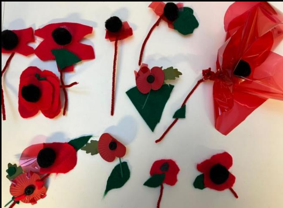
Poppies made by Wellbeing Club

We pay tribute to the special contribution of families and of the emergency services.